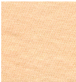
COTTON 100% EXHAUST DYEING

SYNOZOL YELLOW K-HL 0.076% SYNOZOL SCARLET K-SR 0.017%